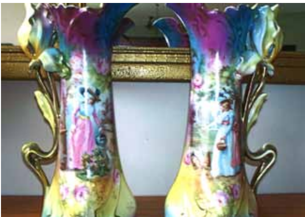
Pair of 10 ¼" Victorian ladies with watering flowers and feeding chickens ewers with iris handles bought in Austria.