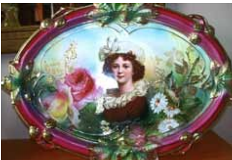
14 ½" x 10 ½" Le Brun with hat surrounded by flowers plaque with red and gold bought in Austria.