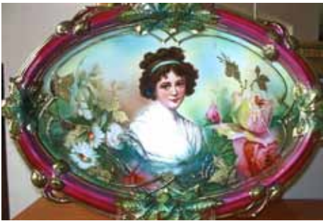
14 ½" x 10 ½" Le Brun with ribbon surrounded by flowers plaque with red and gold bought in Austria.