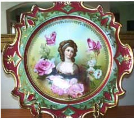
11 ¼" Potocka surrounded by flowers plaque with red and gold bought in Austria.