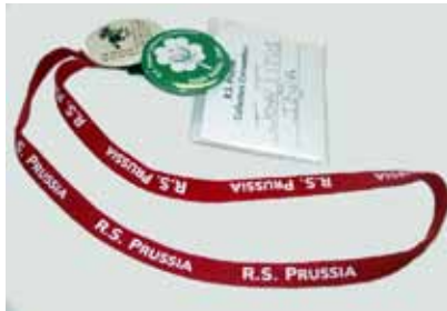
Remember to pack your lanyard!

I also would like to remind you to pack your lanyard/nametag holder for convention. As usual, the name cards for 2014 will fit into this lanyard that we use each year. If you are a first-time convention-goer you will receive one at the registration desk when you pick up a packet.