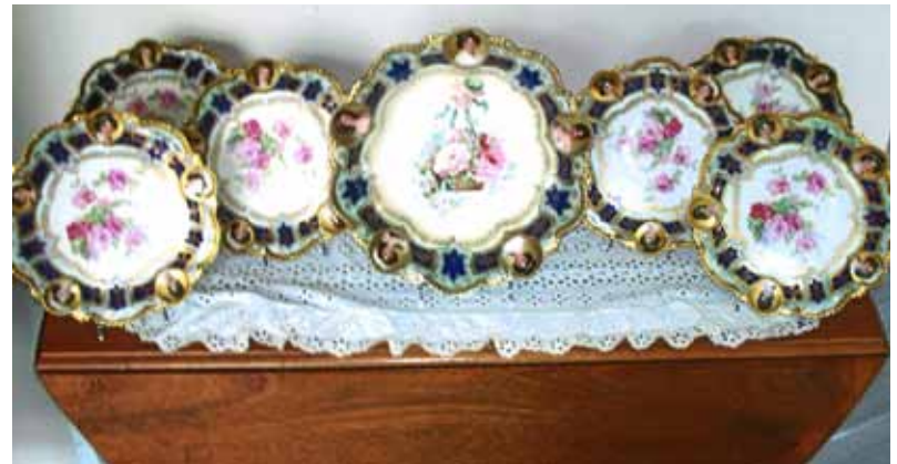
11" Cobalt with medallions (Potocka, Le Brun, and Reclaimer) with hanging basket in the center bought in Germany. Six 8 ¾" matching cobalt with medallions of ladies with floral center bought in the United Kingdom.